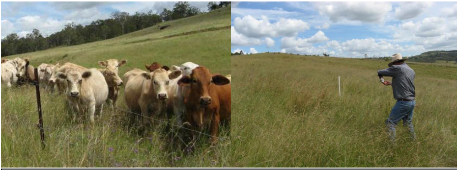
Image: Resting pastures and monitoring species composition can help you to better manage your grazing for production and environmental outcomes.