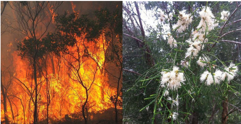
Images: Planning for fire is an important aspect of land management (left image); Swamp tea tree ( Melaleuca irbyana ) is an endangered community in South East Queensland (right image).