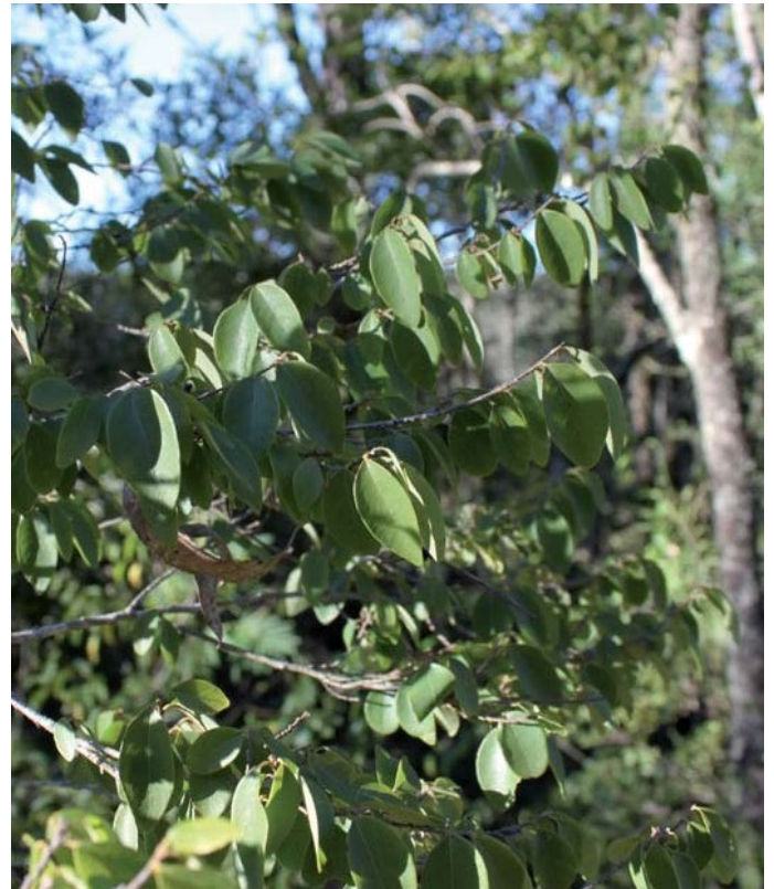
Scrub Ironbark ( Bridelea exaltata )