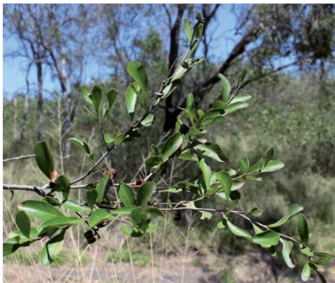
Scrub Boonaree ( Alectryon diversifolius )