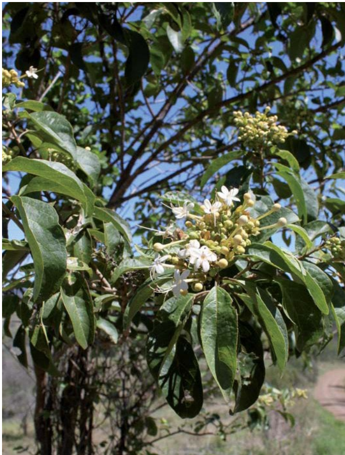
Lolly Bush ( Clerodendrum floribundum )