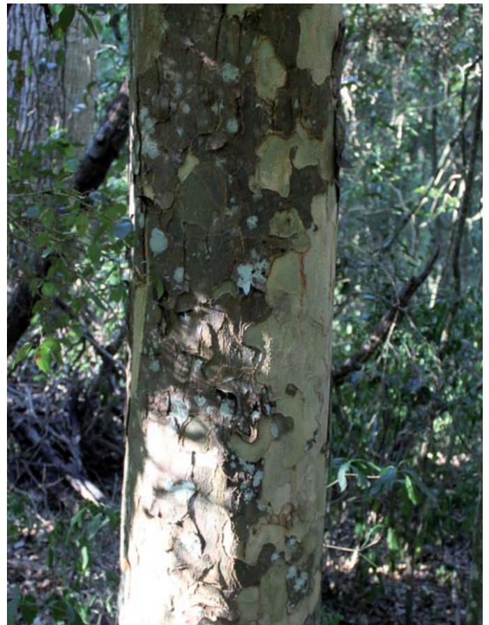
Leopard Ash ( Flindersia collina )