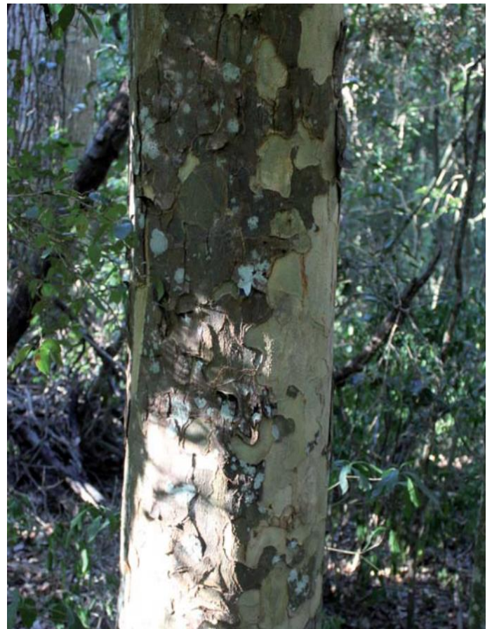
Leopard Ash ( Flindersia collina )