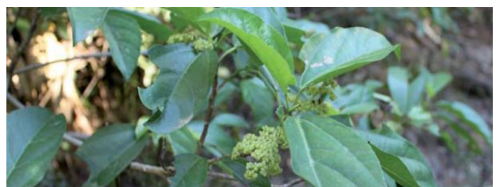
Shiny-leaved Stinging Tree ( Dendrocnide photinophylla )