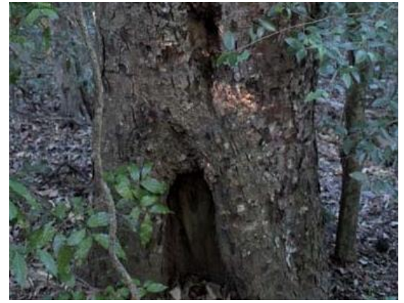
Crows Ash ( Flindersia australis ) was one of the sought after rainforest timber species that grow in RE 12.11.11. The highly durable timber was used for dancefloors, butchers blocks, decking, railway sleepers, coach building and furniture. Large specimens that remain in today's landscape often have features that may compromise the timber quality, which meant they were left by early timber collectors.

Remnant patches of vine scrub also play an important role as reservoirs or source populations for plant and animal species that are able to re-colonise adjacent areas when conditions are suitable. A number of rare and threatened plants and animals live in the Hoop Pine scrubs of SEQ. There are plants with highly localised or restricted distributions for example the Endangered Shiny-leaved Coondoo ( Planchonella eerwah ) and Greasenut ( Hernandia bivalvis ). The threatened Black-breasted Button Quail is a sedentary ground-dwelling bird, which has suffered a major population decline due to clearing and fragmentation of its habitat.