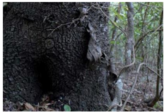
Much of the original extent of RE 12.9-10.16 has been cleared and replaced with Hoop Pine plantations. Young Hoop Pine requires an open or disturbed area to germinate and establish. Large canopy trees (on its right) have overcome these requirements, now towering above other rainforest species. Patches of RE 12.11.11 with an abundance of Hoop Pine canopy trees of approximately the same age, can usually be an indicator of a previous disturbance event, such as fire or a falling tree.