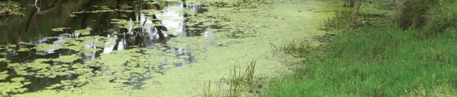
Upper Emu Creek