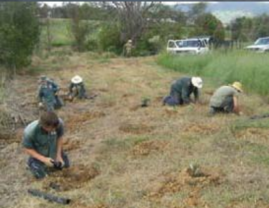
Erosion control in Noosa River