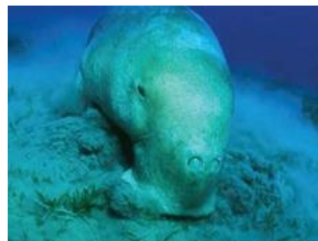
Dugong grazing on seagrass

Efforts are being made by Healthy Land & Water and partners to protect seagrass beds and dugong habitats from disturbance.