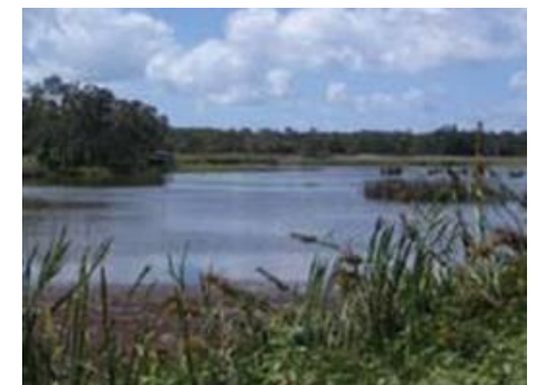
Buckley's Hole, Bribie Island