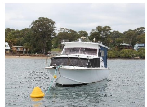
Environmentally friendly moorings