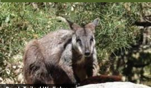
Brush Tailed Wallaby