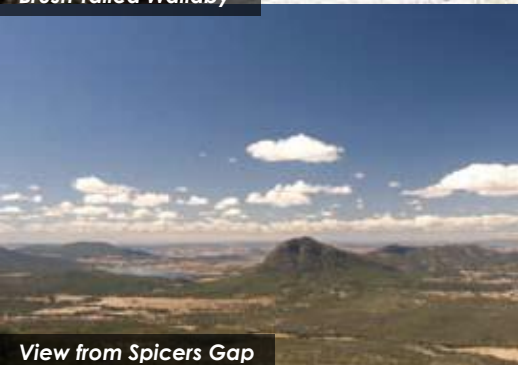
View from Spicers Gap