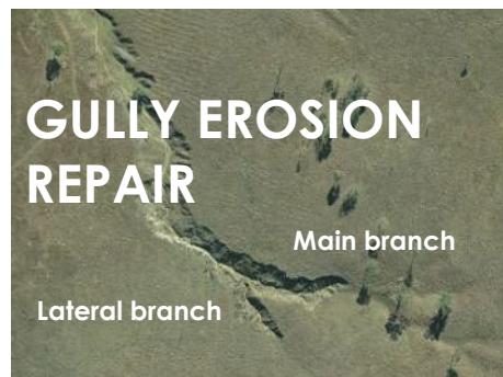
Aerial image showing main and lateral branches of an active eroding gully.

Gully erosion can be complex and expensive to fix and may require specialist advice. It is far better to avoid the impacts on your property and prevent it from occurring in the first instance. Well managed overland flow can help prevent gullies forming.