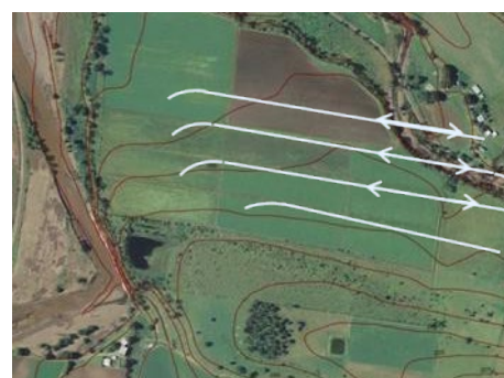
A well designed drainage plan manages the volume and velocity of runoff and safely conducts it to stable discharge points.