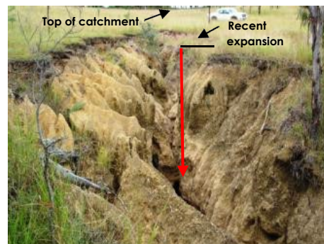
Gully heads migrate up the catchment and range in depth from 30cm to many