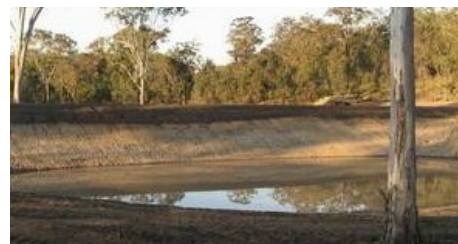
Drowning out a gully head by creating a dam can be a useful way to stabilise a gully.

Detail all engineering works, including battering; hardening the gully head; constructing diversion drains; fencing and relocating or strengthening infrastructure; material requirements; and revegetation works. Provide sufficient detail to allow quantity surveying and implementation by a competent contractor and include: